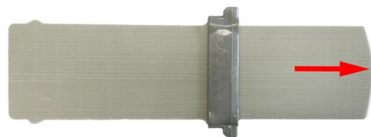
New main plate design