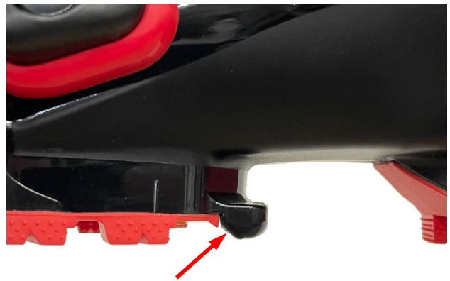
SCARPA TX Pro 2.0 Second Heel “Ramp”